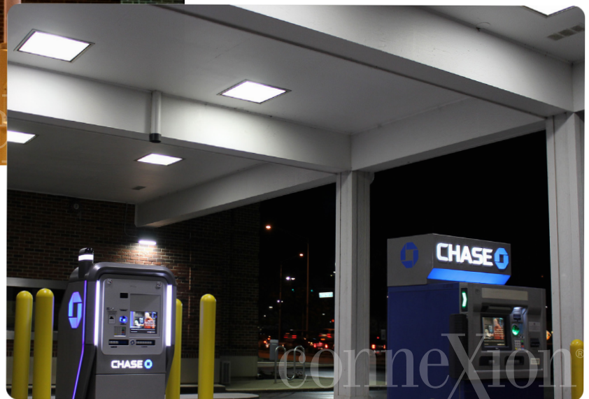
LOUVERS LED RETROFIT KIT PICTURED

We provide complete turnkey services that ensure your project moves seamlessly from concept to completion to measurement and verification.